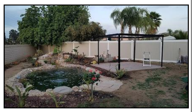
The slab and framework for the gazebo, the most peaceful place in the yard.

• There are lotus and water lilies, and four lights along the stream and pond edges.