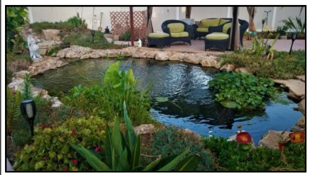
The finished pond now

I don't have one particularly favorite koi type, but enjoy the usual — Tancho, Showa and Kohaku — and I do like the long fin or butterfly varieties for their added flair. I find myself always wanting new koi. (smile)