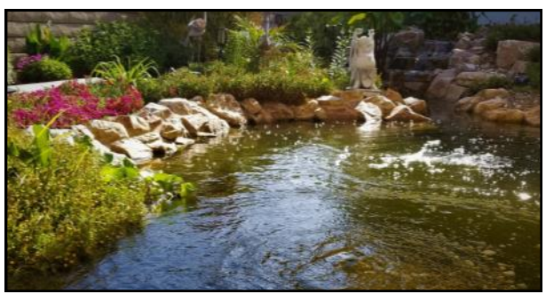
Looking toward the waterfall.

It has been a labor of love and has grown since its origin with improvements of a gazebo and landscaping and of the addition of several koi, mostly purchased from Inland Koi, Andrew's Koi, and the koi rescue from our club. Currently I have about 11 young koi in various sizes, none over 16 inches.