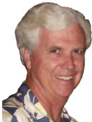
Spike Cover 1940 ~ 4 April 2023