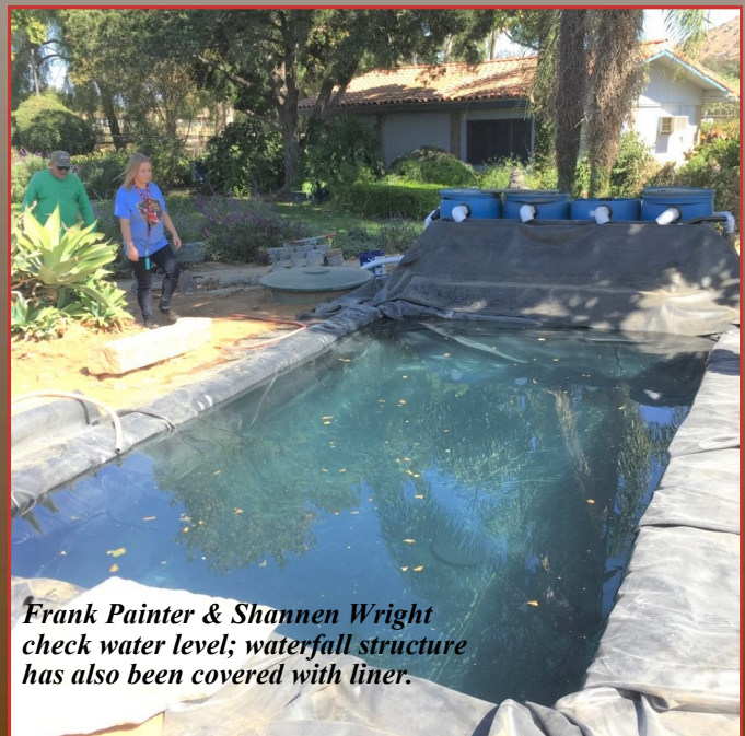
Frank Painter & Shannen Wright check water level; waterfall structure has also been covered with liner.