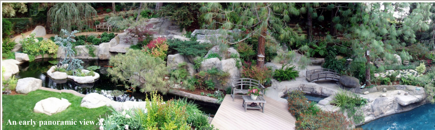
An early panoramic view.